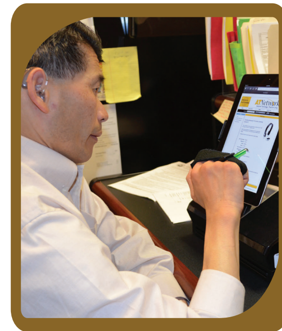
iPad and Stand

Go to the AT Exchange website abilitytools.org/exchange to see what is available for loan. You can search by each DLL location or by keywords. To become a borrower, create a personal account and make email loan requests to borrow devices. If you need help searching or don't have access to the Internet, contact Ability Tools or your local DLL.